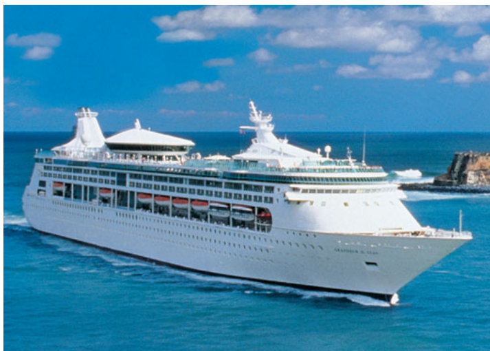
Bid on a cruise to Bermuda aboard Royal Caribbean's Enchantment of the Seas .

Guests will enjoy live music, hors d'oeuvres, Dogfish Head beer and Teller wines from 4 to 7:30 p.m., as they shop for a large array of items, trips and services.