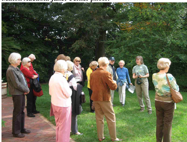
Members, volunteers & friends enjoyed a trip to Georgetown, Washington, DC to visit Tudor Place & Dumbarton Oaks.

Beans, Buttons, and Boats! Patriots and Tories! Hawks and Doves! The list is only a sampling of the topics for which the cheerful, dedicated, and thoroughly professional members of the Milton Historical Society’s Education Committee will design programs. In the eighteen months since its creation the committee has invited students from pre-school through sixth grade to participate in educational activities which connect the holdings of the Museum to the curriculum standards of the schools. Back will be old favorites of ours, of our community’s students, and of their teachers. These include programs which make use of artifacts and create activities associated with significant Milton historical events such as shipbuilding and button making. Last year, the committee took advantage of two major exhibits mounted at the Museum to expand our educational offerings. The Smithsonian Institution’s “Fences” exhibit and the Museum exhibit commemorating the Great 1909 Milton Fire provided the committee with opportunities to enrich the learning of our community’s school children and to establish a connection between them and our Museum.